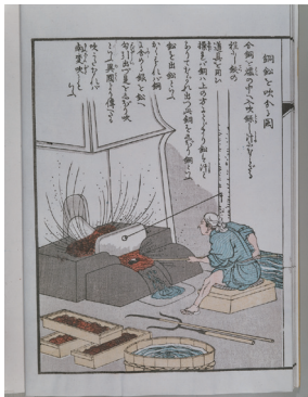
Sumitomo's original copper refining method

At the beginning, the Founder's Precepts call on us to "Not only in matters of business but in all situations, make efforts with deepest gratitude in every aspect" as well as to refine ourselves to develop a trustworthy character rather than just pursuing money-making endeavors. In the main text, the precepts emphasize the importance of honesty, prudence, and sound management. Sumitomo became involved in the business of refining copper from the time of Tomomochi Sumitomo (1607 – 1662), the adopted second-generation head of the family. That move was rooted in a refining technology for extracting silver from copper known as "Nanban-buki (Western Refining)", which was developed in the 16th century by Riemon Soga (1572 – 1636), Tomomochi's biological father. The history of the business spans about 430 years. Carrying on founder Masatomo's business philosophy, Tomomochi expanded the business from Kyoto to Osaka, and disclosed the Nanban-buki technology to other copper refiners. Sumitomo thus came to be looked up to as the head family of Nanban-buki, and Osaka subsequently became the center of the copper refining industry in Japan.