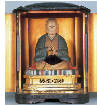
Wooden statue of Masatomo Sumitomo (1585 - 1652)