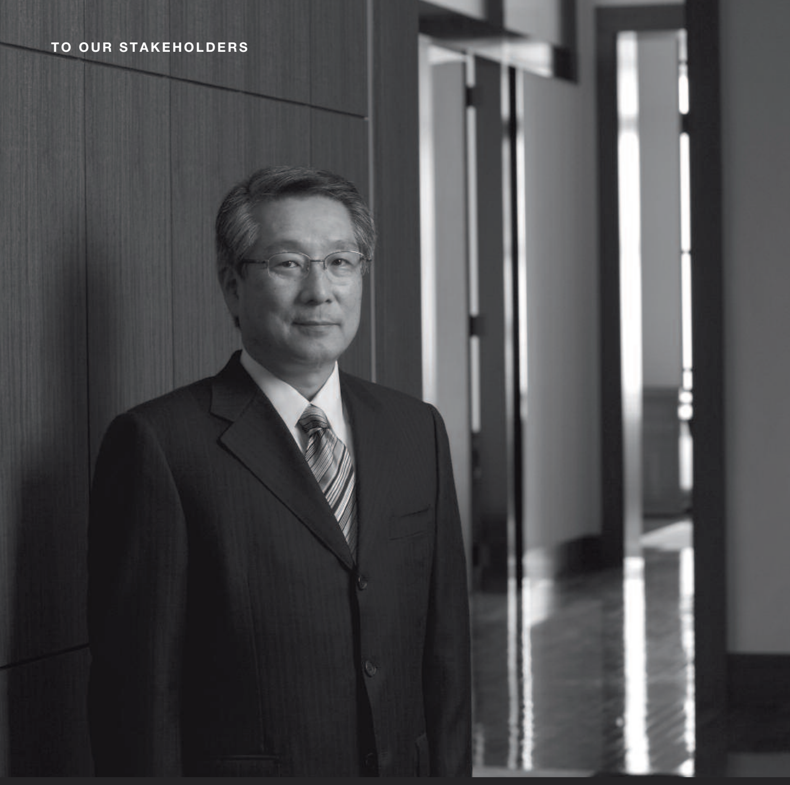
Results for Fiscal 2006 and the AG Plan