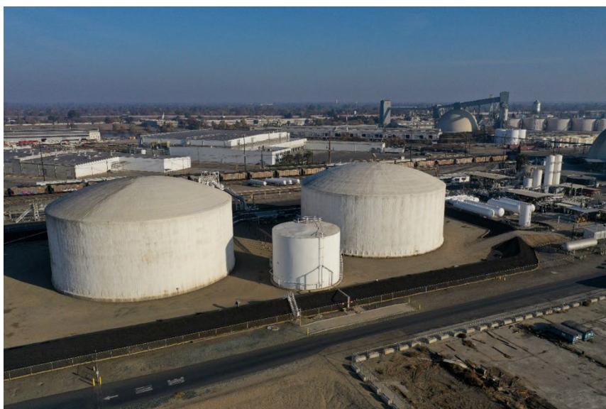
CALAMCO Ammonia Terminal in Stockton, California