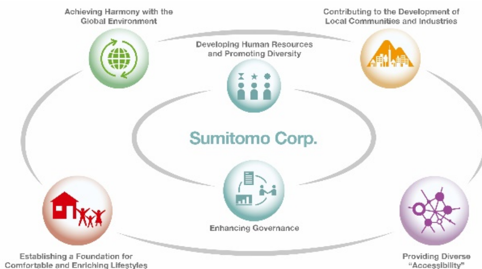
Figure: Material Issues for the Sumitomo Corporation Group