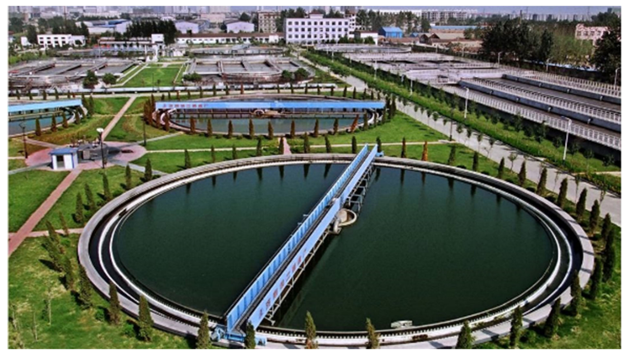
[Sumitomo Corporation website]

develop and operate water supply and sewerage facilities in several countries by partnering with local businesses. Such projects are based on the prerequisite of building sustainable infrastructure in harmony with the natural environment and society. It mitigates risks arising from each stage of infrastructure development to operation by complying with relevant laws and regulations in the relevant country and identifying environmental impacts through environmental assessments. In the water supply business, the company supplies safe, high-quality water through efficient water intake based on the finite nature of water resources, while conserving the environment in the basin of a river from which water is taken. The sewerage business helps prevent water pollution and improve hygiene by achieving both energy savings and treatment capacity enhancement through facility operation optimization.